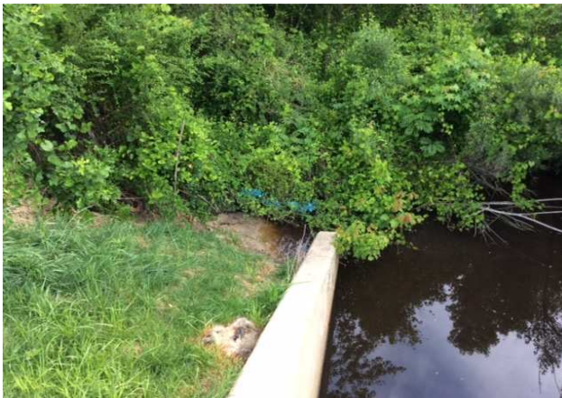
(Utility Locate at end of Wing Wall)

The Contractor shall adhere to all applicable regulations and follow accepted safety procedures when working in the vicinity of utilities in order to insure the safety of construction personnel and the public.