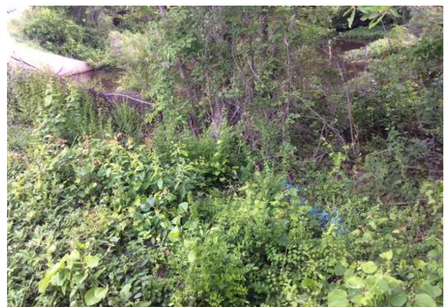
(Utility Locate near end of Wing Wall)